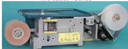
Solid Unit Dose/Barcode Packaging Machine